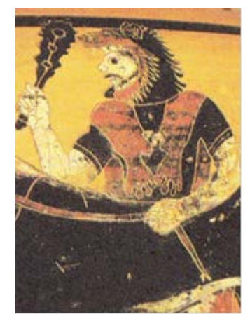
Fig.12 Ancient Greek Painted Pot.

The curved Tao is a bag holding the bow, which is often used in Tang Dynasty. It takes the shape of crescent, and is often made of tiger, leopard and other animal skins (Figure 9). It is used with