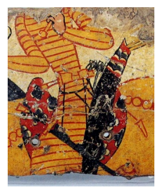
Fig.10 Sogdian Warrior of the Central Asia.