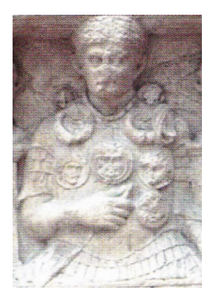
Fig.2 Figure of Ancient Roman Solider, Stone Carving